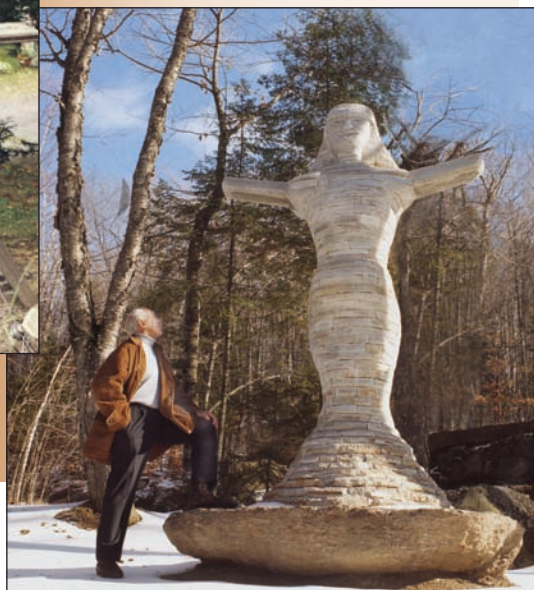
Universal Woman on a Half Shell , based on Botticelli's The Birth of Venus , balances on a 4-tonne rock base.