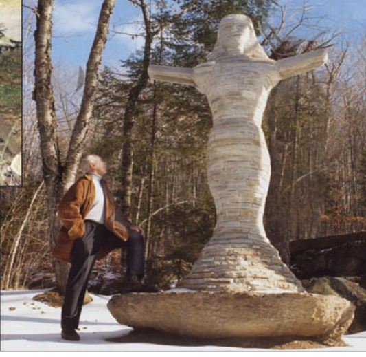
Universal Woman on a Half Shell, based on Botticelli's The Birth of Venus . balances on a 4-tonne rock base.